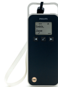
Avalon Wide Range Pod