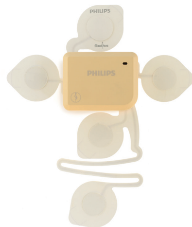
Avalon CL Fetal & Maternal Pod and Patch

Assistant Divisional Director of Midwifery Gloucestershire Royal Hospital