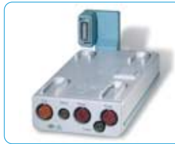
The Hemodynamic Extension.