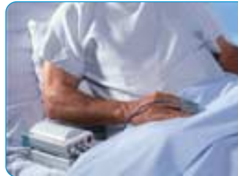
The Multi-Measurement Server travels easily with patients throughout their hospital stay.