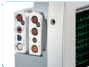
Connected to the Philips IntelliVue patient monitor.