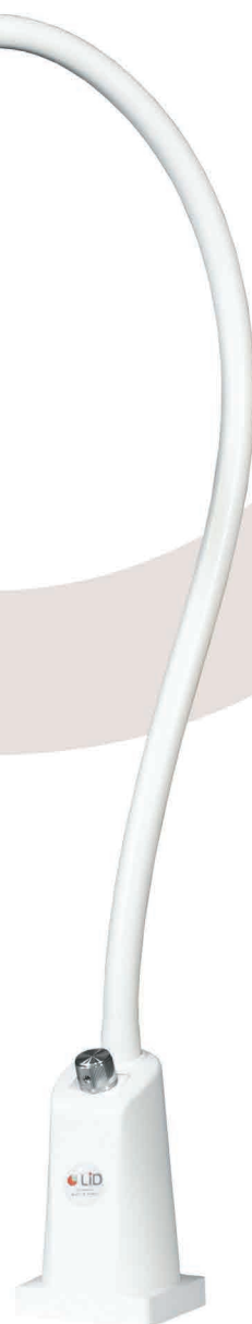
Hepta 65 | Dimmer switch