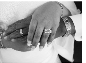
▼ Dark Skin Patient