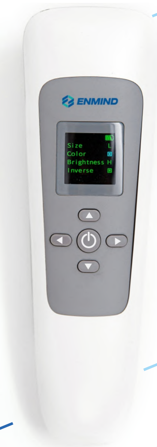
VV-100 Vein Viewer

Shenzhen Enmind Technology Co.,Ltd. Add: Room 201,Block A,No.1,Qianhai Road 1, Qianhaishen Port Cooperative District, Shenzhen,518000,P.R.China. Tel:+86(0755) 2331 6007 E-Mail: sales@enmind-tech.com