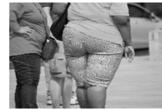
▲ Obese Person/Bloated Patient